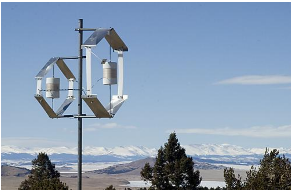
Isotron 80/40 Combination Our Most Popular Unit!