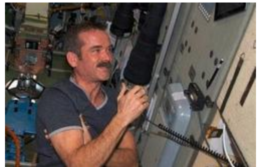
Astronaut Chris Hadfield, VA3OOG, speaks to students from NA1SS in 2013.

The deadline to submit proposals is May 15. Proposal webinars for guidance and questions will be offered on April 11 at 7 PM EDT (2300 UTC) and on April 16 at 9 PM EDT (0100 UTC on Wednesday, April 17). Advance registration is required. More details , such as expectations, proposal guidelines, and the proposal form, are on the ARISS website.