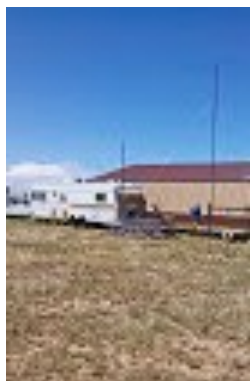
PPRAA special event operation.