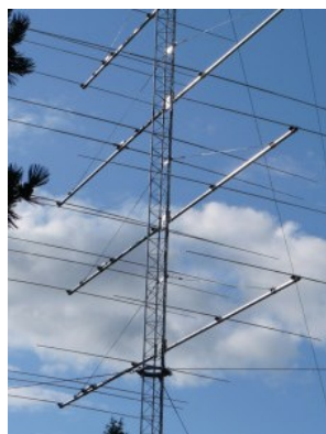
K2PO—Remote Ham Radio