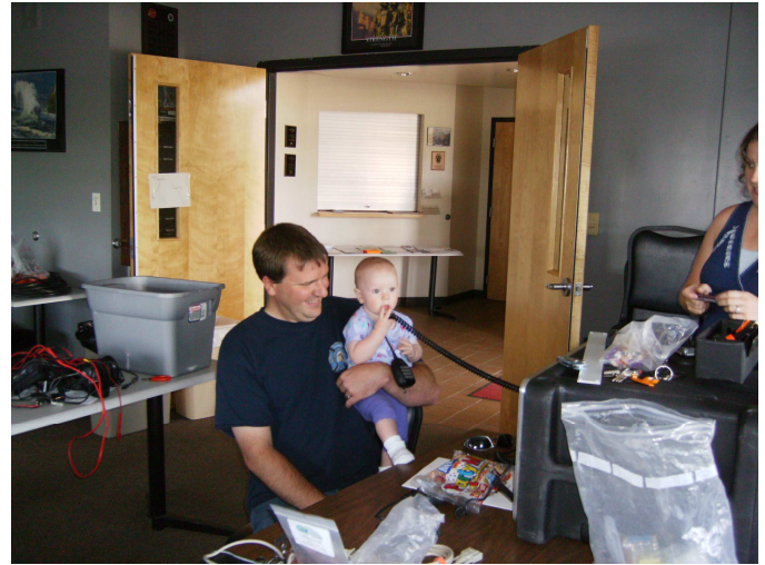
Youngest operator on site!