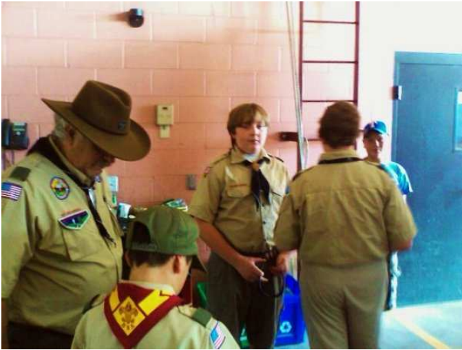
The scouts are here! The scouts are here!