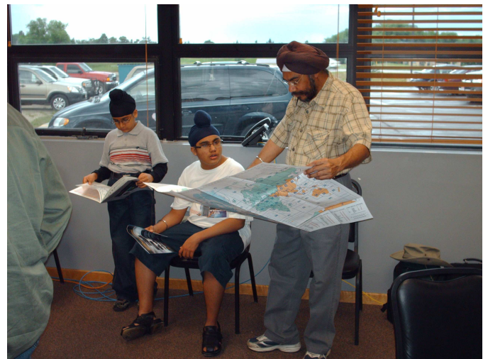
New prospective hams at Field Day

The PPRAA is a federal 501(c)(3) nonprofit organization, and welcomes all contributions. Your contributions or donations may be tax-deductible.