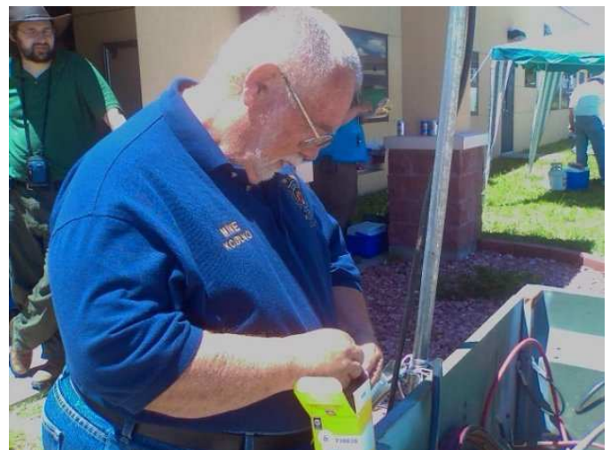
Mike is the power supply OOC?