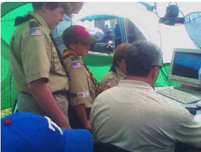
Scouts at the GOTA station