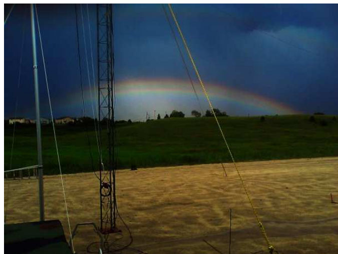
The stations ionized the atmosphere