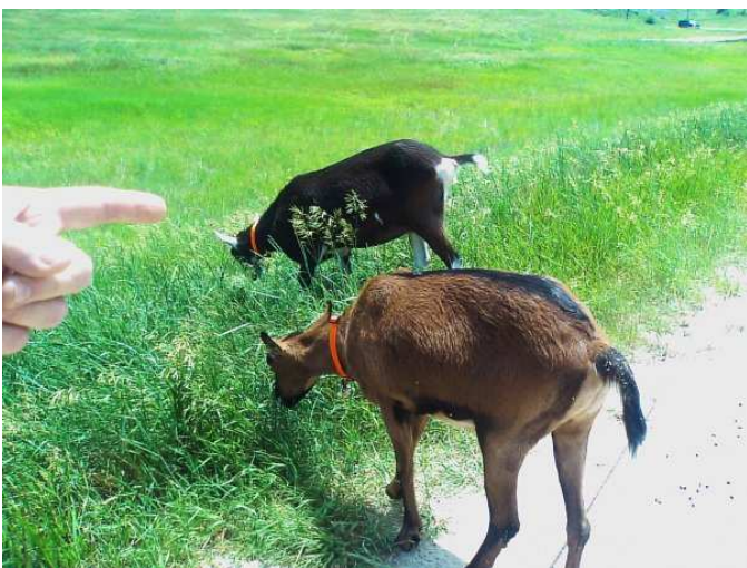
Who brought the lawn mowers?