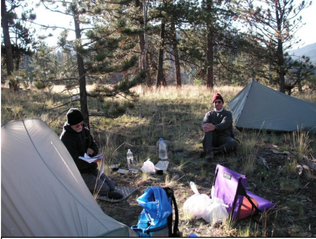
Saturday morning breakfast

I hung my inverted Y in the tree, connected up my ATS-II, flipped the switch to turn it on, and heard . . . nothing. Nada. The ATS-II announces its name in CW when you turn it