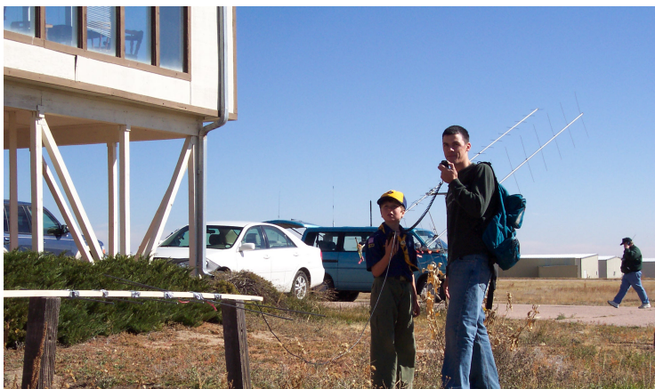
Testing 2-mtr beam built at JOTA 2004

The folks from EOSS will be putting up another high