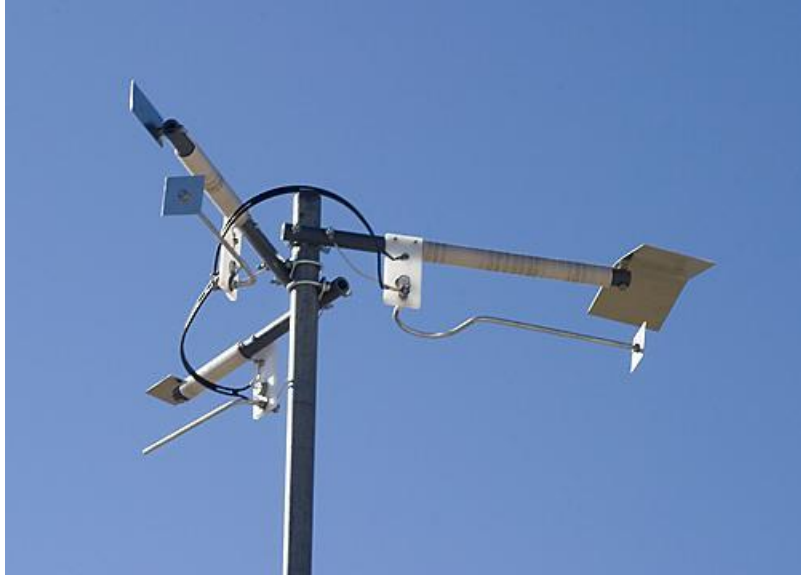
Isotron 40 ISOTRON 20/15/10 SO SIMPLE AND SO RUGGED! www.isotronantennas.com

This article will also appear on our web site.