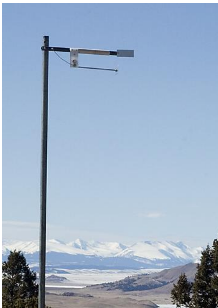
ISOTRON 15 The Bands Are Finally Open. http://www.isotronantennas.com