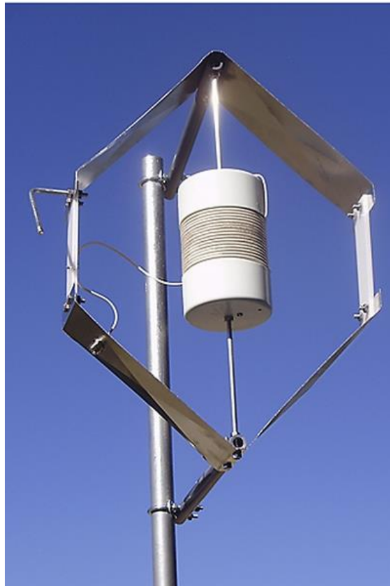
The 40 Meter Isotron Antenna