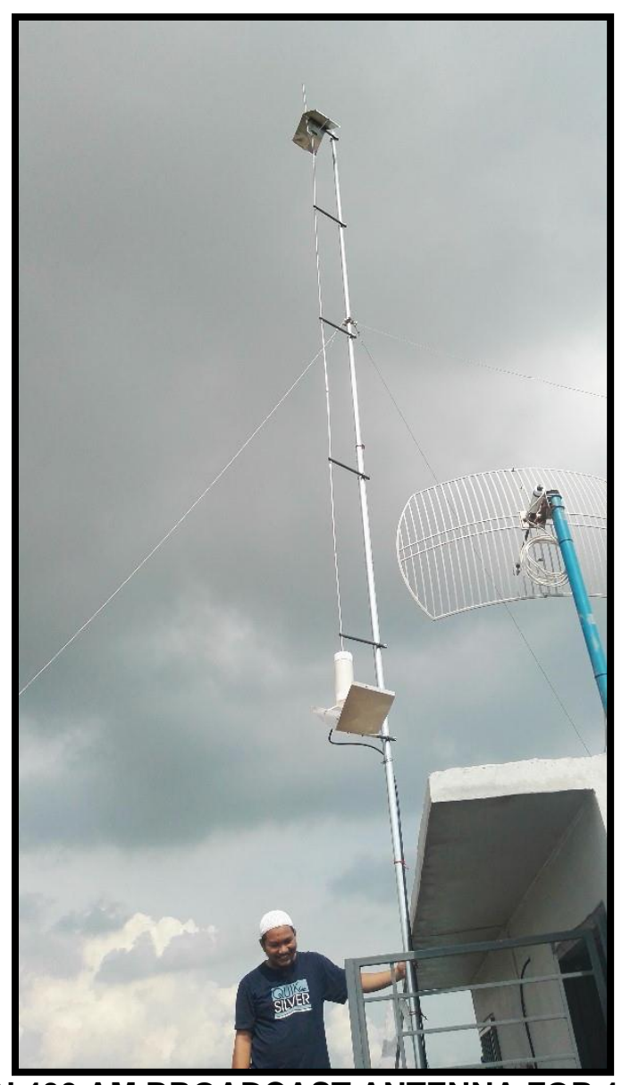
ISOTRON 400 AM BROADCAST ANTENNA FOR 1053 KHZ. INDONESIA WE MAKE ANTENNAS FOR .500 MHZ TO 54 MHZ www.isotronantennas.com