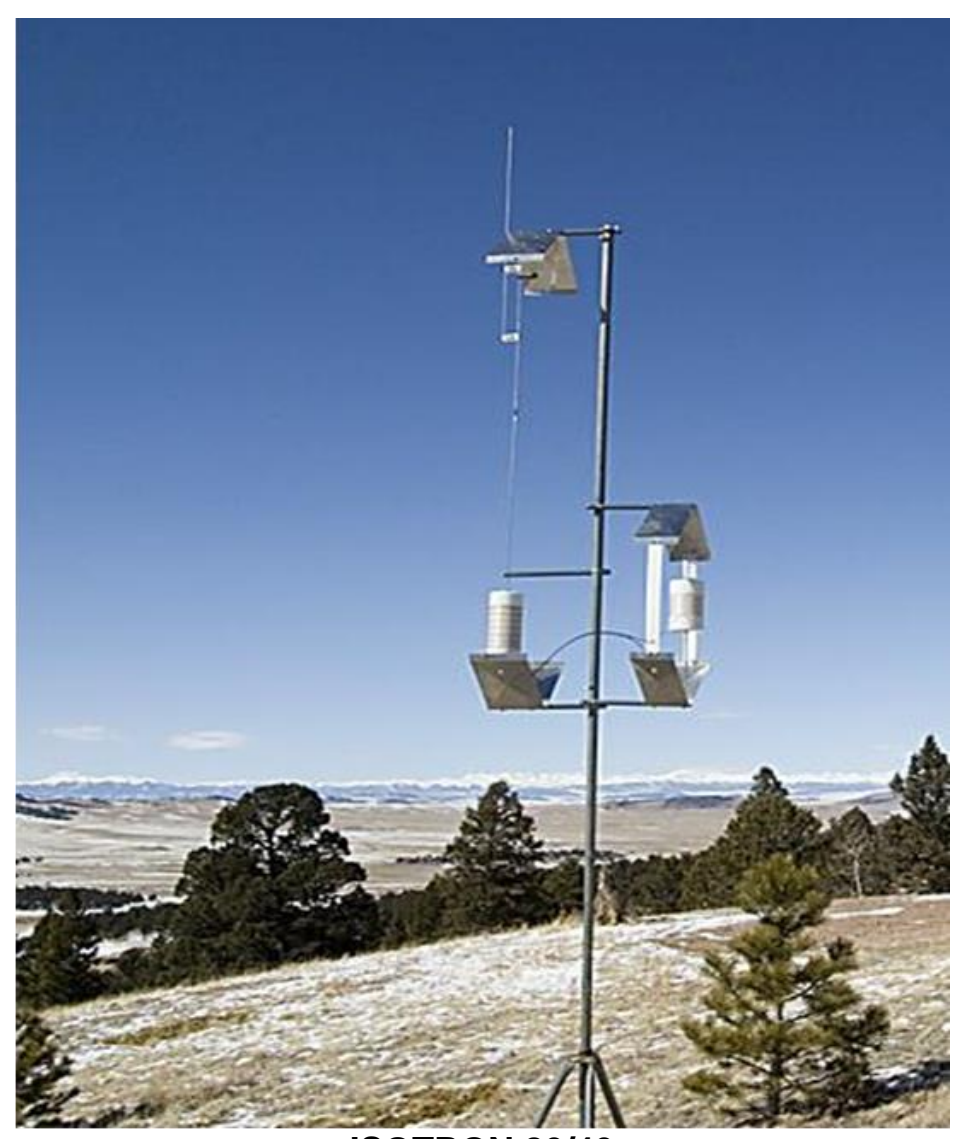
ISOTRON 80/40 GET READY FOR THE FALL HF SEASON