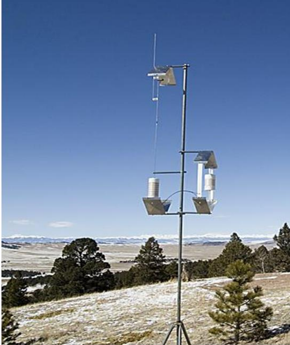
ISOTRON 80/40 GET READY FOR THE FALL HF SEASON