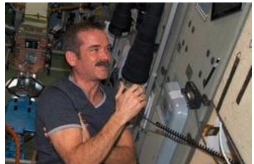
Astronaut Chris Hadfield, VA3OOG, speaks to students from NA1SS in 2013.

The deadline to submit proposals is May 15. Proposal webinars for guidance and questions will be offered on April 11 at 7 PM EDT (2300 UTC) and on April 16 at 9 PM EDT (0100 UTC on Wednesday, April 17). Advance registration is required. More details , such as expectations, proposal guidelines, and the proposal form, are on the ARISS website.