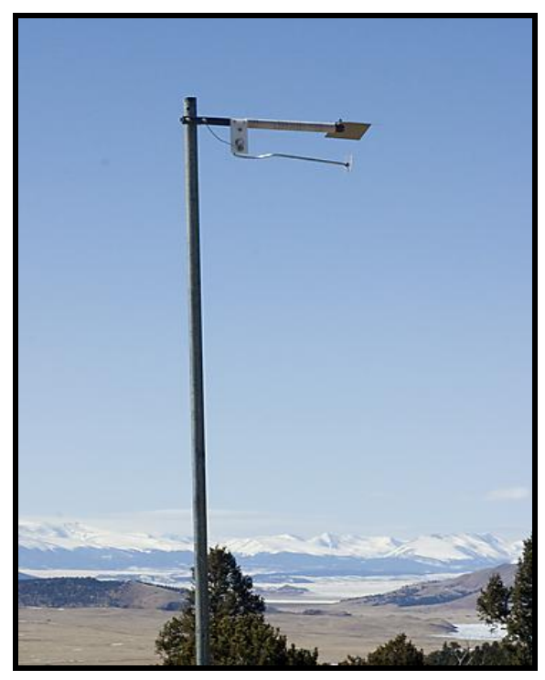
ISOTRON 20 A WORK HORSE FOR 20 METERS