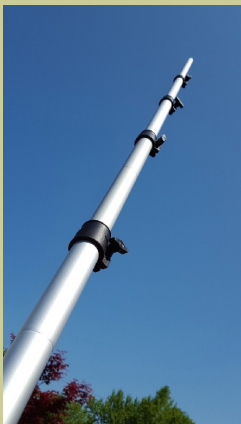
21 FOOT TELESCOPING ALUMINUM MAST LIGHT WEIGHT AND SMOOTH OPERATION