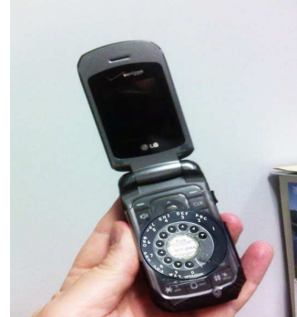
Sr. Cell Phone

Have something to sell or trying to find something or just want to see something get to a good home? Send it in to wv7t@arrl.net and see it in Dits and Bits.