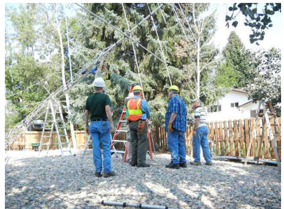
The planning committee