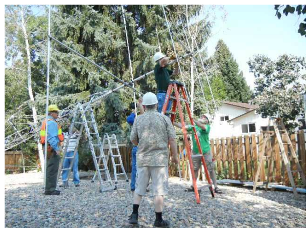
WØEM monitoring the progress