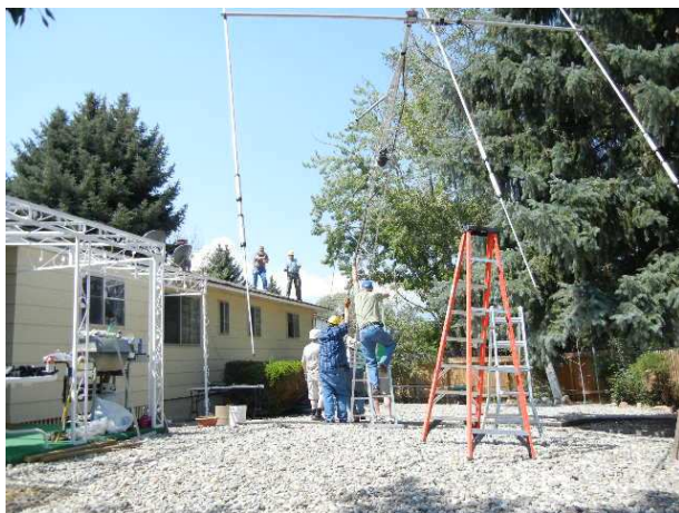
Dropping the tower