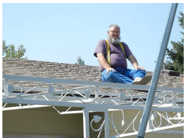
WV7T holding down the roof