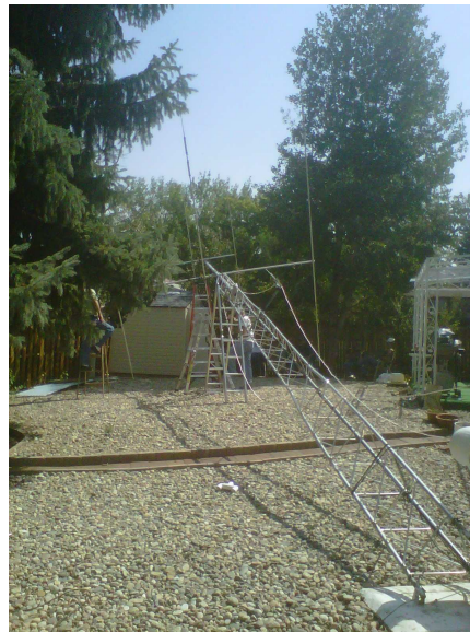
This tower was a big job