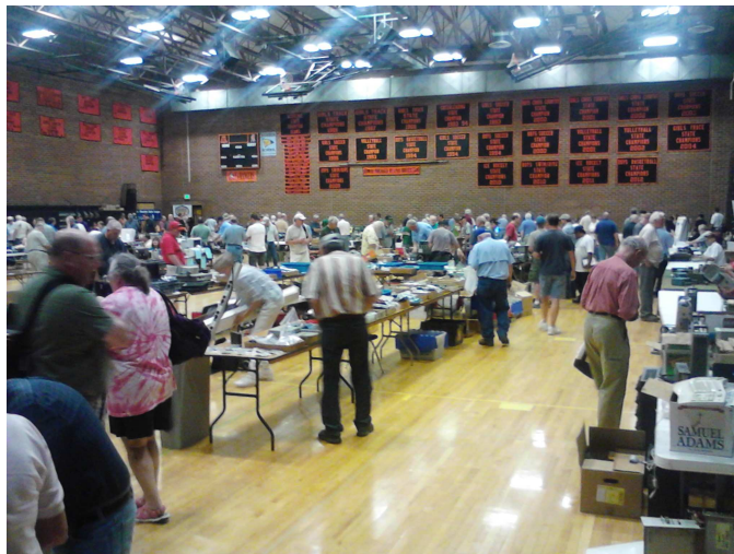
WOW! Bargains to be had.