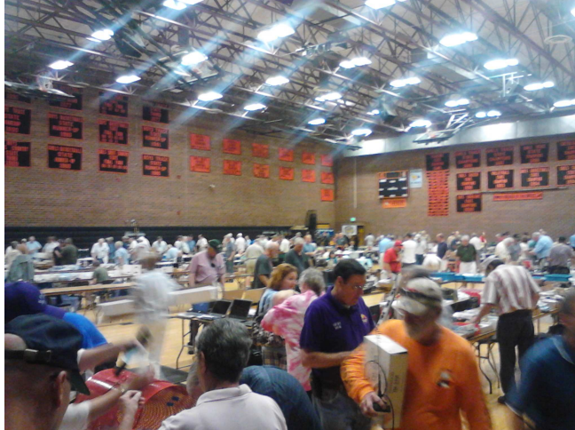
Megafest was a very busy place