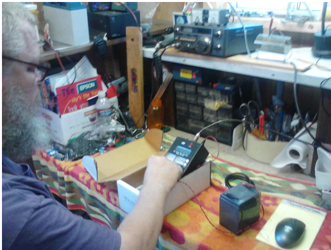
The tuner don't work