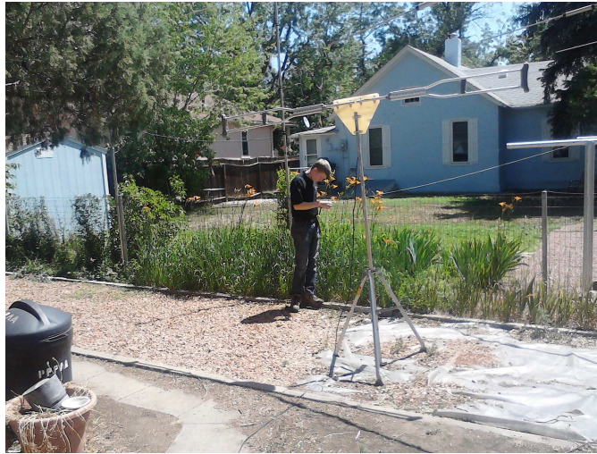
Another student working on the 20m wire dipole. “Crutchzilla” is in the fore ground.