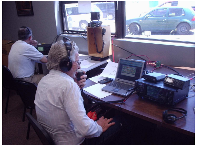
Field Day Is A Great Contester Training Event