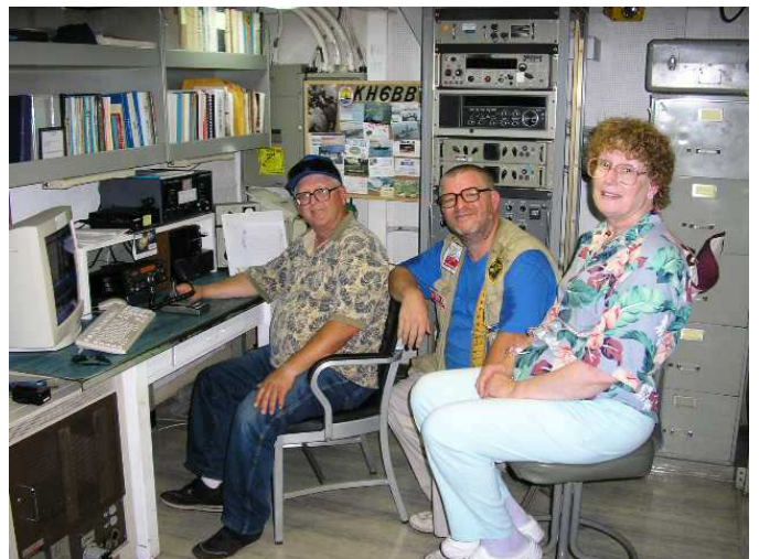
Contesting From A DX Location Is Great. This Is The Radio Room On The USS Missouri KH6BB, Pearl Harbor Hawaii.