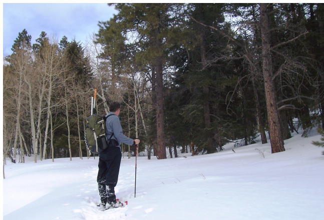
KØNR snow shoeing up Mt. Herman

place to park that did not block the road, grabbed the snowshoes and started our climb.