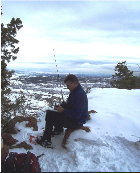
KØNR operating VHF on Mt. Herman

grids on various bands: DM78 (Colorado Springs area), DM89 to the east, DN70 (Longmont/Fort Collins area) and DM68 (Buena Vista). I was feeling OK about that (not rare DX but at least I got outside my grid.)